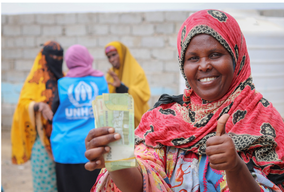
A Somali refugee collects cash assistance from UNHCR at Kharaz camp in Lahj governorate, south-west Yemen.

Kharaz camp was opened in 2001 and remains the only refugee camp in Yemen. The majority of the nearly 9,000 refugees here are Somali, with others from Ethiopia. UNHCR uses cash-based interventions to provide protection, assistance and services to the most vulnerable refugees – including survivors of sexual and gender-based violence, foster parents of unaccompanied and at-risk children, and families facing acute needs. Refugees receive between US$80 and US$200, depending on their needs and level of vulnerability. Despite the conflict that began in 2015, Yemen continues to host over 280,000 refugees and asylum-seekers.