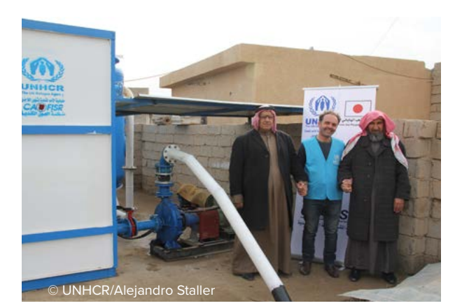
Rehabilitation of a Water Treatment Plant by UNHCR in Baghdad Governorate, Iraq.

voluntary return and reintegration where feasible, while also pursuing local integration and settlement elsewhere in the country. The United Nations, along with the international community in Iraq (humanitarian, development, stabilization, and social cohesion actors), are working to support the Government of Iraq in advancing durable solutions to internal and protracted displacement.