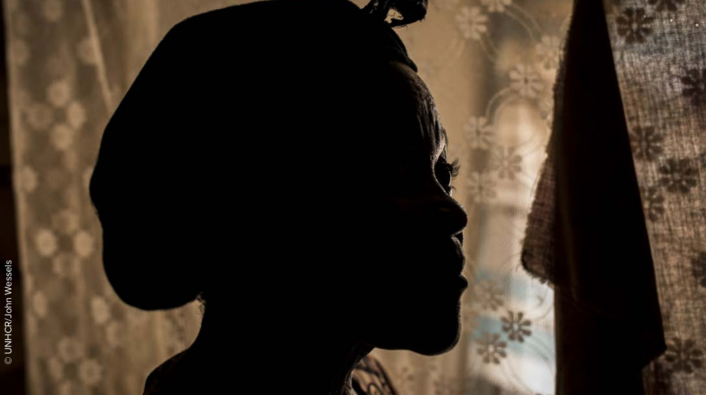
Internally displaced Congolese woman found refuge in Tshikapa in the Kasai region of south-central Democratic Republic of the Congo (DRC) after being displaced during the conflict in 2017.