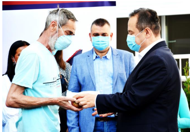
Delivery of keys to refugees for apartments in Kruševac, ©UNHCR, 17 Sep 2020

On 30 Sep, partner BCHR organized a webinar on “ Recognizing Refugee qualifications ”, featuring presentations by Council of Europe and NARIC Italy, and attended by 46 representatives of state institutions, IGOs and NGOs. One refugee from Sudan was supported by BCHR to obtain a seasonal job and one refugee from Burundi gained a more permanent employment . One client from Libya succeeded in becoming a member of the medical chamber and is being supported in looking for work. Ten ID Cards and seven works permits were received by asylum-seekers and refugees in September thanks to BCHR’s efforts.