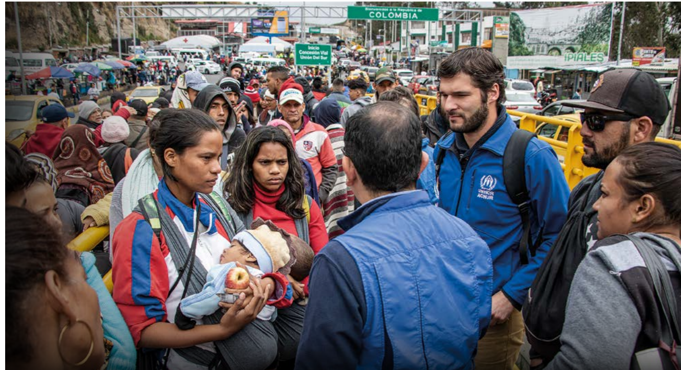
UNHCR staff at the Rumichaca International Bridge provide information, legal assistance and aid items to Venezuelan refugees and migrants crossing from Colombia into Ecuador, ahead of the implementation of new visa laws.