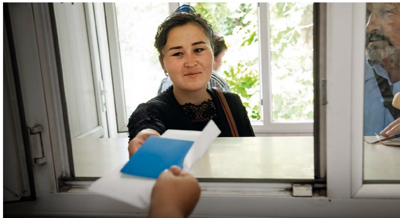
A formerly stateless young woman obtains citizenship and the right to work in Kyrgyzstan.