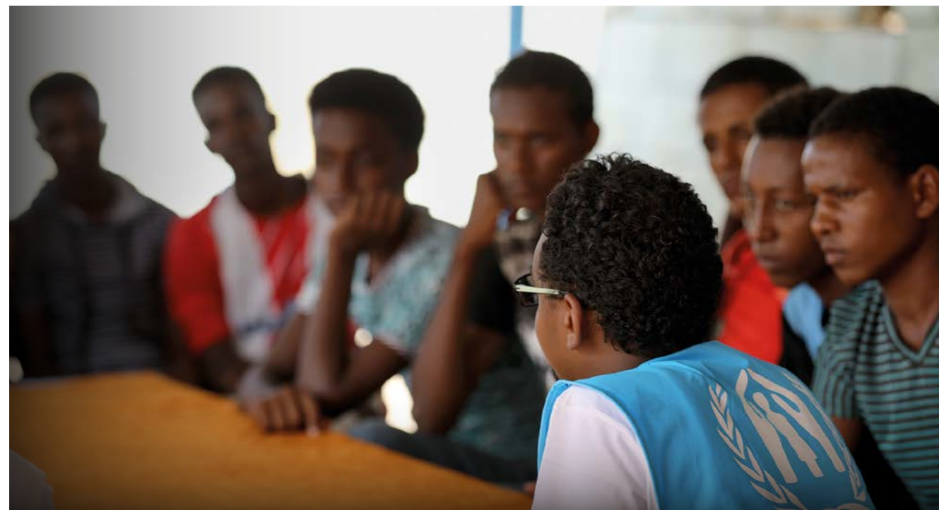
UNHCR holds a focus group with unaccompanied minors at Shagarab refugee camp during an anti-trafficking campaign in east Sudan.