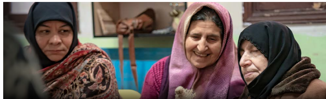
Older persons find friendship in a UNHCR-supported centre in Aleppo, Syria.