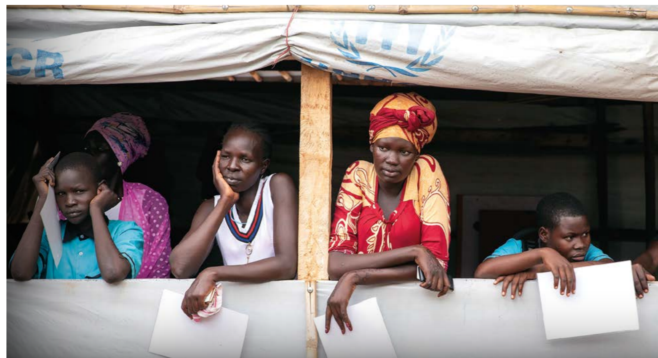
Biometrically registered Ethiopian refugees in South Sudan wait for a food distribution in Gorom refugee camp.