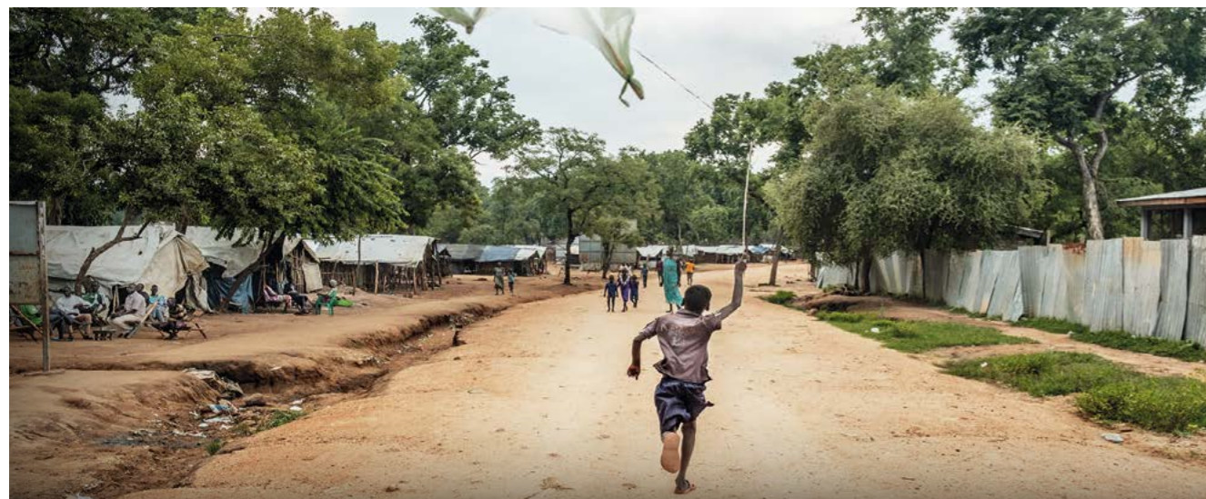
A young South Sudanese refugee flies a kite in Jewi refugee camp, Ethiopia.