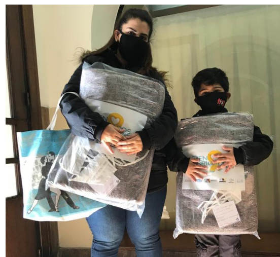
Venezuelan family receiving winter kits amidst the COVID-19 pandemic in Buenos Aires