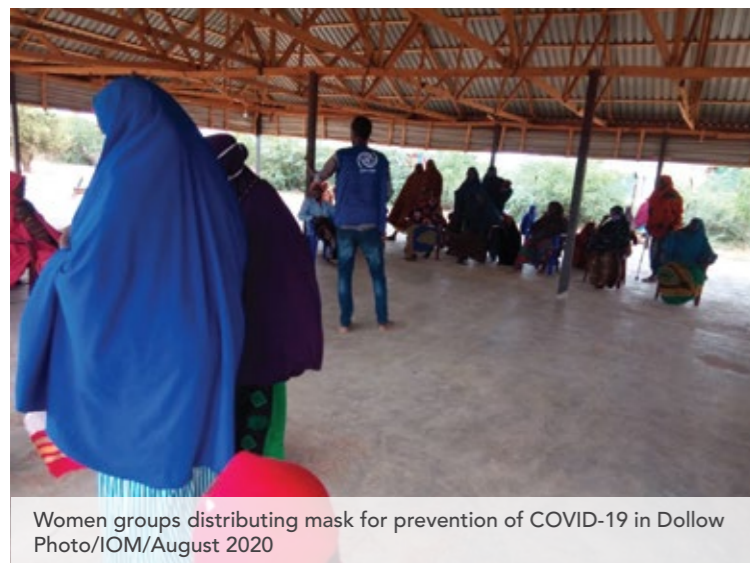
Women groups distributing mask for prevention of COVID-19 in Dollow Photo/IOM/August 2020

1,859 complaint cases were recorded by partners at their respective CFM systems; out of the 1,859 complaints, 81% were solved and closed.