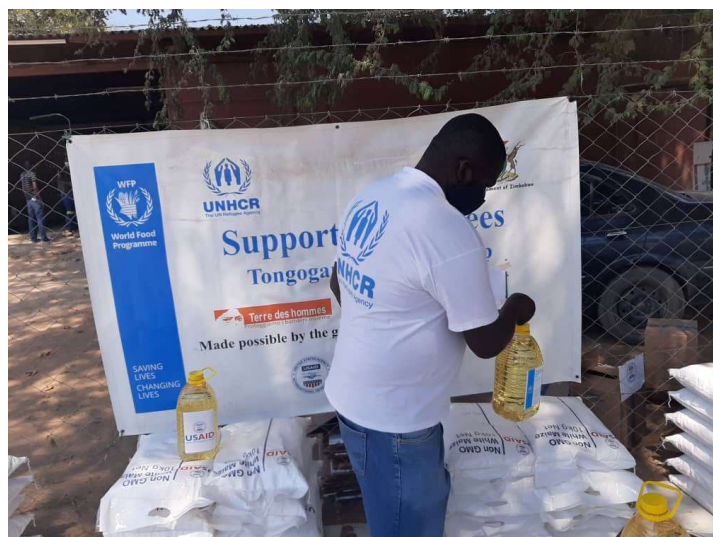
Food distribution preparations in Tongogara refugee camp