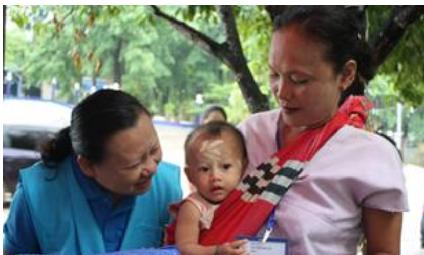
So far in 2019, a total of 875 refugees voluntarily returned from Thailand following decades of displacement in a facilitated return movement led by the respective governments and supported by UNHCR and partners.