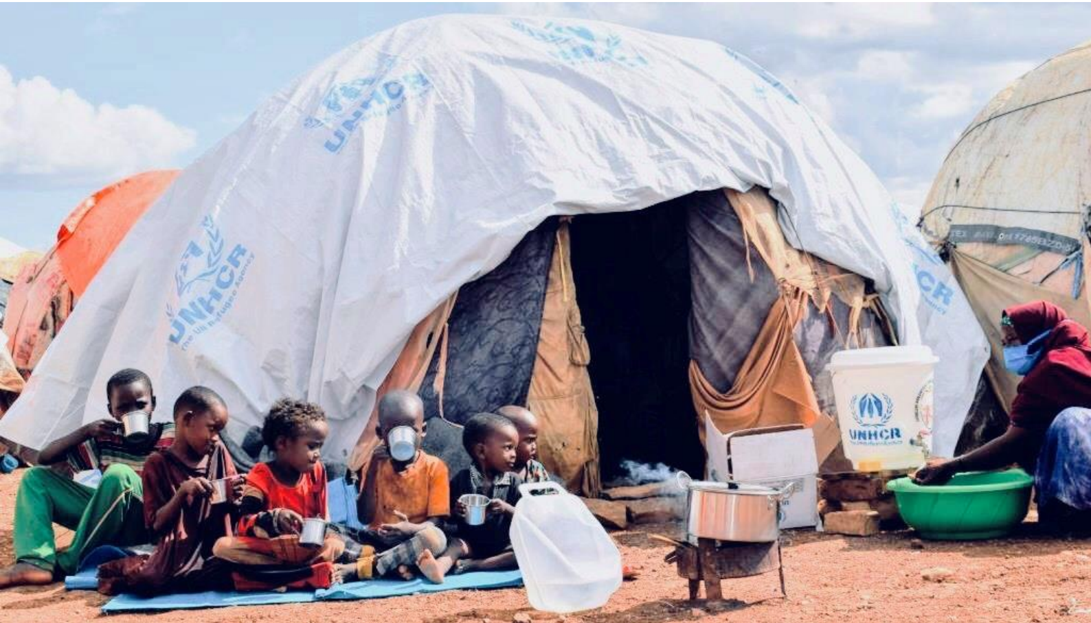
Internally displaced family in Baidoa provided with hand washing facility aimed at preventing COVID-19 infections.