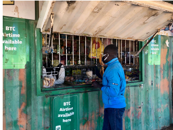
A customer wears a face mask while shopping for groceries in Dukwi refugee camp, Botswana.