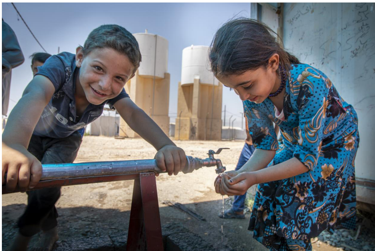
Iraq. Providing potable water and raising awareness among children about the importance of hand washing is essential for preventing the spread of COVID-19.