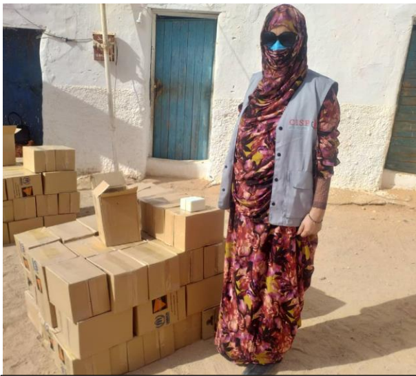
Soap distribution monitoring.

UNHCR has adapted its activities during the pandemic to the changing circumstances, while continuing to provide lifesaving assistance.