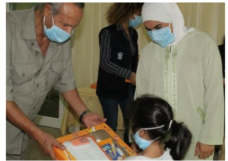
UNHCR partner CTR distribute school kits to refugee and asylum-seekers pupils in Tunis

UNHCR Tunisia is grateful for the support of European Union | Italy | Luxembourg | Monaco | Netherlands | RDPP NA – EU | Switzerland | United Nations Multi-Partners Trust Fund | United States of America and to those who have contributed to UNHCR programmes with unearmarked and softly earmarked funds.