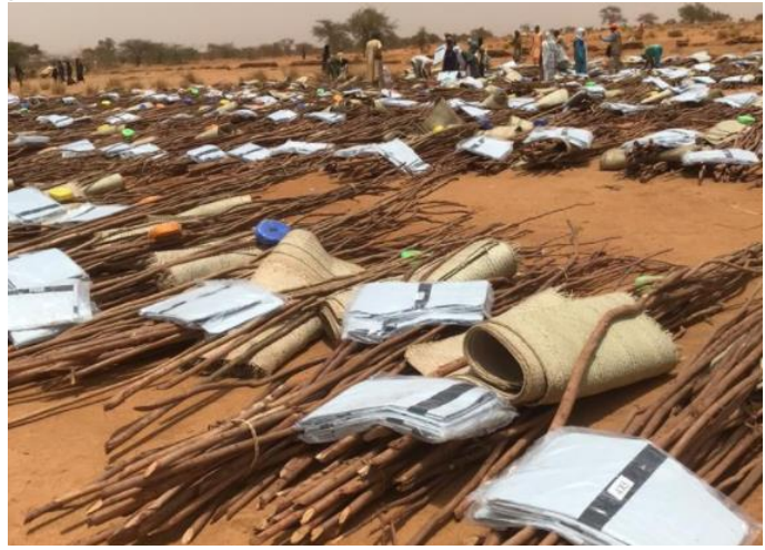
Emergency shelter consists of a shelter kit with tarpaulin, mats, wood, ropes and tools for construction which can be used to provide a simple but sturdy shelter.