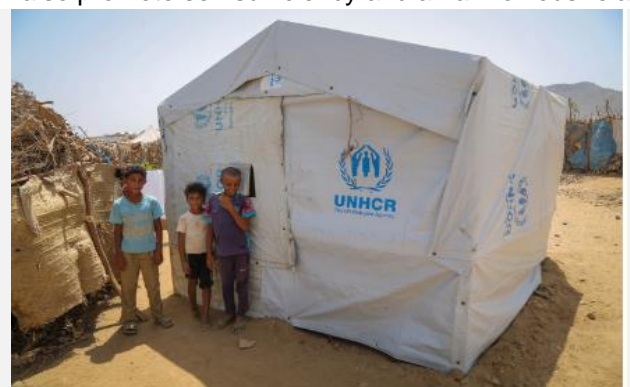
An Emergency Shelter Kit (ESK) is the UNHCR standardised shelter that consists of plastic tarpaulin sheets and sisal ropes. These last up to six months and are distributed, as an emergency solution to families recently displaced.

also promote self-sufficiency and a harmonious relationship with hosting communities.