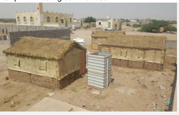
A Transitional Shelter Unit (TSU) is built with iron pipes and local materials. It withstands extreme weather conditions, such as heavy rain, strong wind, humidity and heat. This longer-term shelter solution can last up to five years with proper maintenance