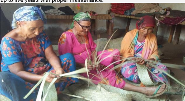
The active involvement of IDP and host community families in the production of Khazaf (palm leaf mats) for the TESK and TSU brings income to the families, especially to the women living in rural areas.