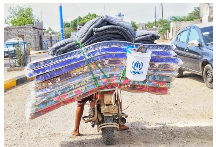
UNHCR and partners assisted a recently displaced family with basic items including a solar lamp.