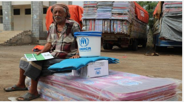
A basic household item distribution consists of mattresses and blankets to match the family size, a kitchen set, two buckets and a solar lamp. UNHCR and partners also raise awareness on COVID-19 through information sessions and brochures on the distribution day.