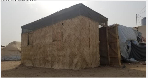
A Tehama is a type of an ESK, with an extra layer of palm leaves (Khazaf) produced by displaced families (IDPs) and host community members. This shelter is more suitable for the hot and humid climates of the west coast governorates, and easier to upgrade to TSUs.