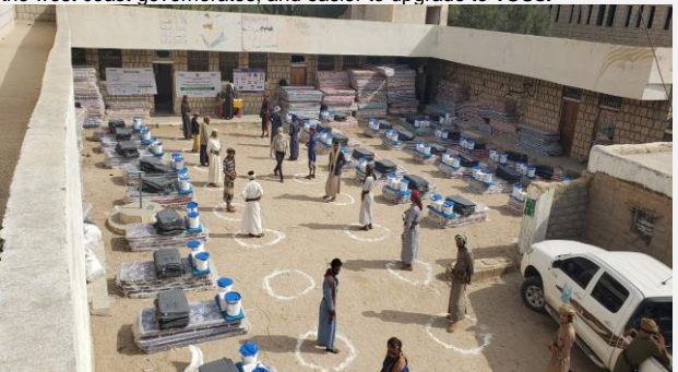
UNHCR is adopting measures to prevent against the spread of COVID-19 and to mitigate its impacts. Physical distancing is maintained at queues, while door to door assistance is incorporated whenever possible.