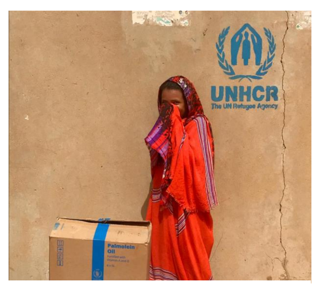
A refugee girl in Mbera camp received food assistance and core relief items during the monthly food distribution