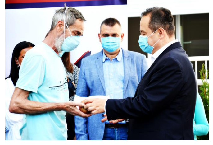
Delivery of keys to refugees for apartments in Kruševac, ©UNHCR, 17 Sep 2020

On 30 Sep, partner BCHR organized a webinar on " Recognizing Refugee qualifications ", featuring presentations by Council of Europe and NARIC Italy, and attended by 46 representatives of state institutions, IGOs and NGOs. One refugee from Sudan was supported by BCHR to obtain a seasonal job and one refugee from Burundi gained a more permanent employment . One client from Libya succeeded in becoming a member of the medical chamber and is being supported in looking for work. Ten ID Cards and seven works permits were received by asylum-seekers and refugees in September thanks to BCHR's efforts.