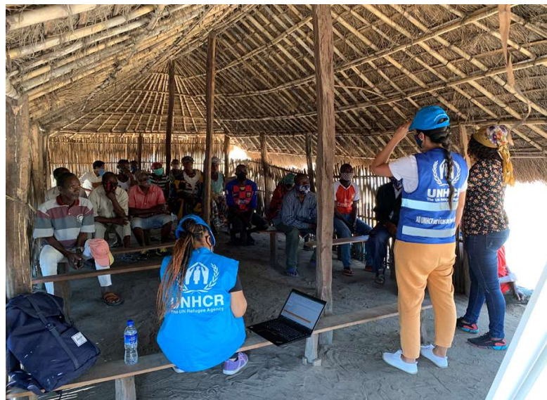
Focus group discussions in Montepuez District, Cabo Delgado Province, to assess possible livelihoods interventions in the area.