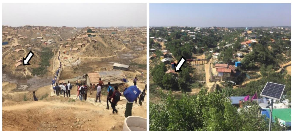
A view from UNHCR's distribution point in Camp 17 (Kutupalong refugee settlement) in 2018 (left) and 2019 (right), which demonstrates the regrowth taking place with the assistance of the LPG intervention. An arrow points to the same location in each photograph.