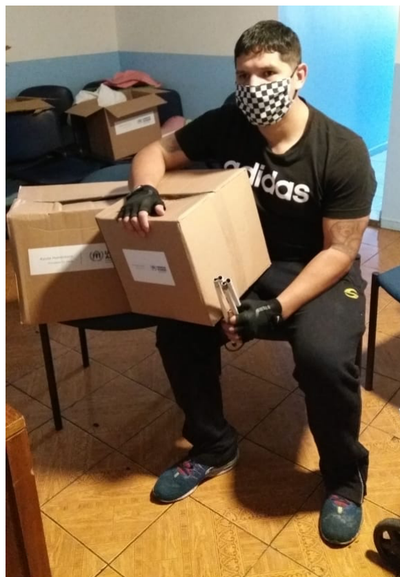
Chile. UNHCR supports refugees and migrants receiving food box delivered by the Municipality of Estación Central

level. Partnering with ILO, IOM and the municipality and counterpart agencies in Mexico City , the project seeks to further access to employment and social protection programmes, while developing inclusive livelihoods approaches.