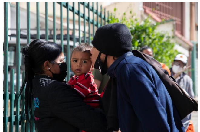
Venezuelan family during a winter items distribution in La Paz