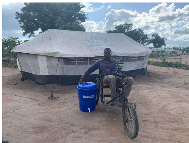
As part of the COVID-19 prevention response in Mozambique, UNHCR and partners distributed Core-relief items (a 50 lts bucket with tap; a 20 lts bucket and 5 soap bars) to families affected by Cyclone Idai last year who are currently living in IDP resettlement sites in Sofala Province.