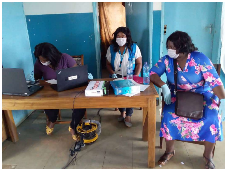
UNHCR and partner staff at a Community Help Desk in Meheba Refugee Settlement