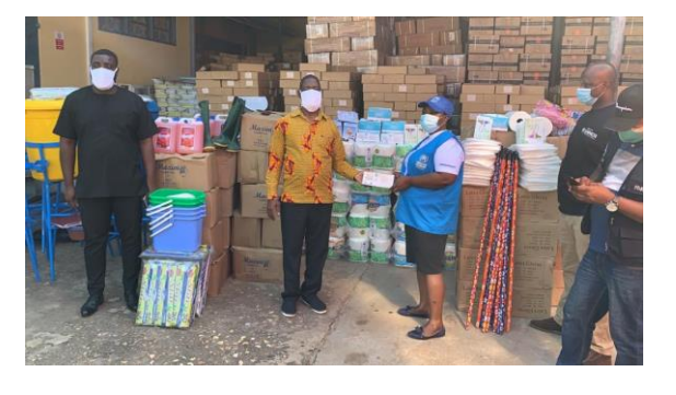
Donation of PPEs by UNHCR Ghana to Health Facilities in Volta Region to help fight covid-19