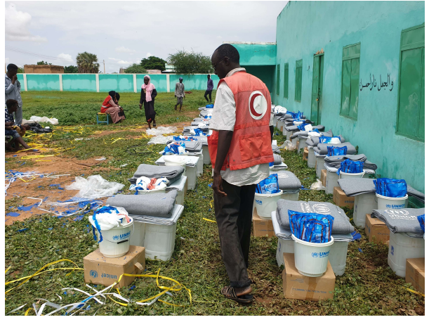
UNHCR and partners during a distribution to flood survivors

So far, no major outbreak of COVID-19 in refugee camps in Sudan has been reported.