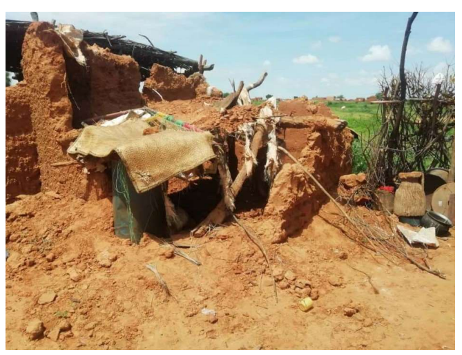
One home out of thousands damaged by heavy rains in West Kordofan.

UNHCR assessment missions met communities in the larger Khartoum where a total of 14 South Sudanese refugees went missing after flash floods hit their houses and one little girl drowned. A boat mission reached an area at the Nile's devastated banks some 15 kilometers outside the capital where South Sudanese refugees live alongside their Sudanese neighbours. The men in the area lost their jobs as brickmakers in the aftermath of the disastrous events. Hygiene levels have plummeted following the collapse of latrines during the flooding which left people no other choice than open defecation.