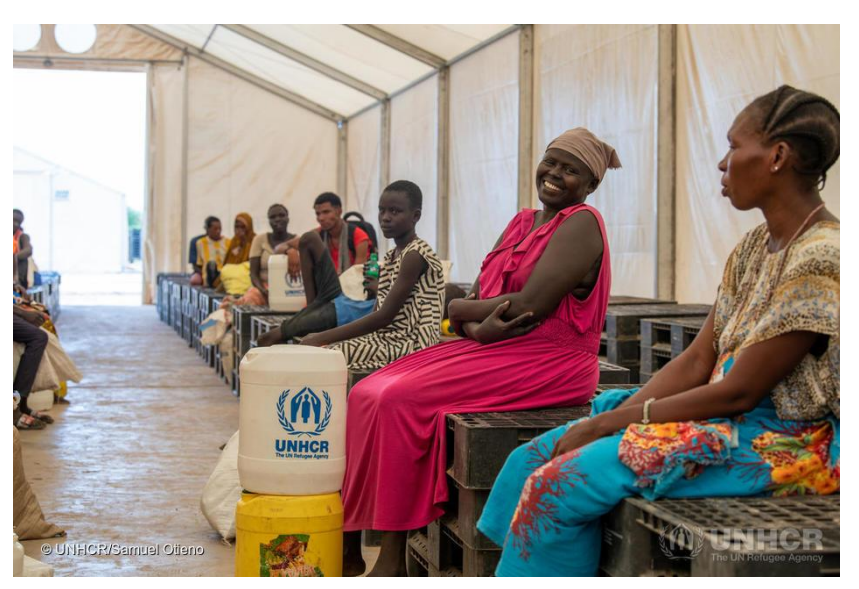
Food and relief items distributed during COVID-19 global pandemic: Refugees at Kakuma camp in Kenya await a distribution of food, hygiene kits and relief items, while practising social distancing.

Operations across the region have with their engaged already established community structures, such as SASA! activities in Rwanda and Uganda. Mobile phones and SIM cards were distributed in community-based Diibouti to structures to help with referrals of SGBV cases. In South Sudan, community volunteers, including student volunteers, have been trained to facilitate safe disclosure and refer SGBV survivors. In Dadaab, community structures continue to monitor hotspots and to sensitize the community at block