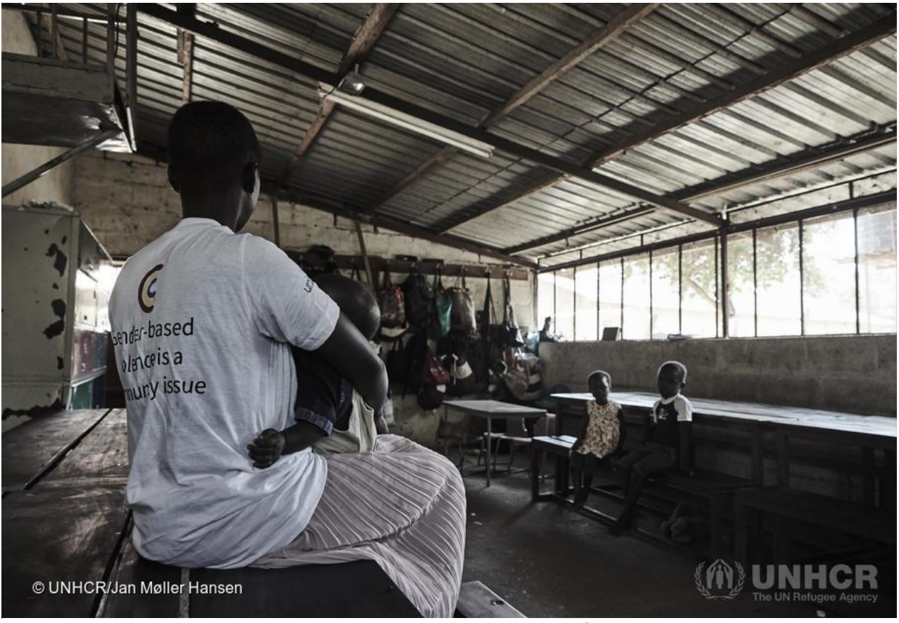
A young woman who has survived serious sexual violence in South Sudan at a home for women and children in Juba, Sudan.