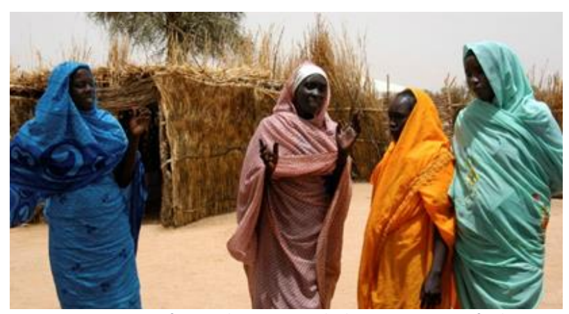
IDP women in West Darfur in Sudan. Women who leave IDP camps to fetch water or collect firewood run the risk of being attacked, assaulted and raped by militia groups. UNHCR provides training and workshops in the camps in West Darfur addressing the gender roles of men and women, attitudes and beliefs about those roles, how to support victims of rapes, and issues of confidentiality for victims.

Movement restrictions and confinement have hampered access to services for survivors, and for women and girls at risk. Women centres offering counseling and psychosocial support activities, and other safe spaces, have been working at a slower pace over the past four months due to the reduced presence of partners. In some instances these