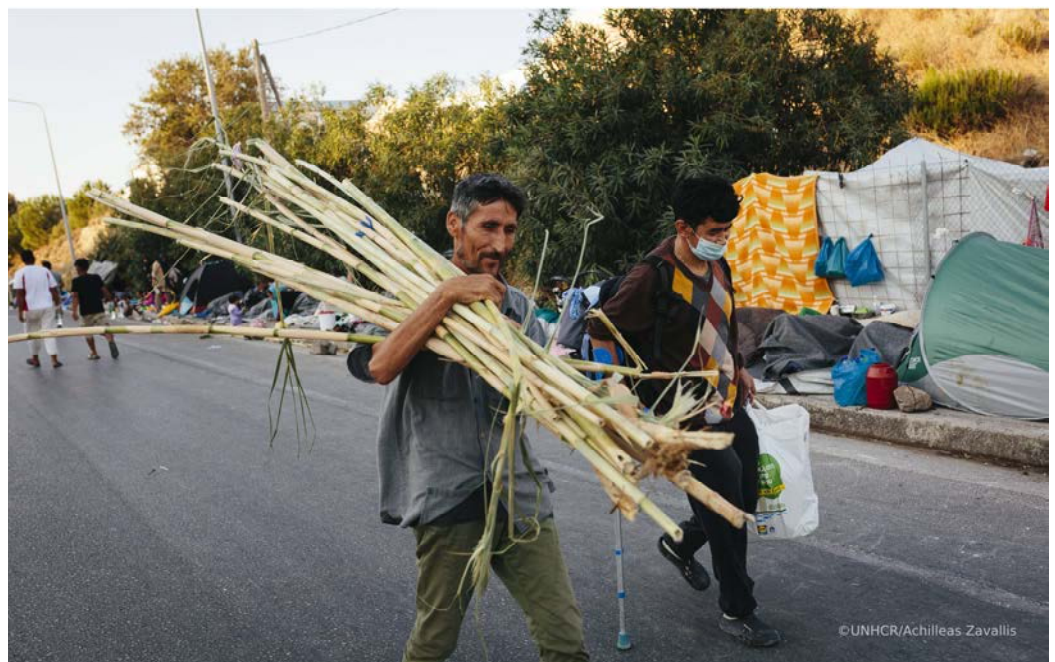
An asylum-seeker carries bamboo to build a makeshift shelter for his family, after the Moria reception and identification centre was destroyed by fires.

4 Field Units in Evros, Ioannina, Leros, Rhodes