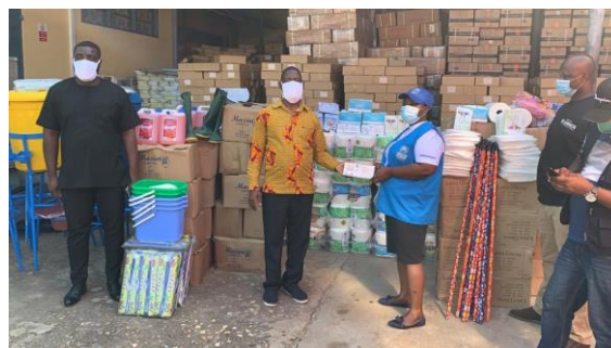
Donation of PPEs by UNHCR Ghana to Health Facilities in Volta Region to help fight covid-19