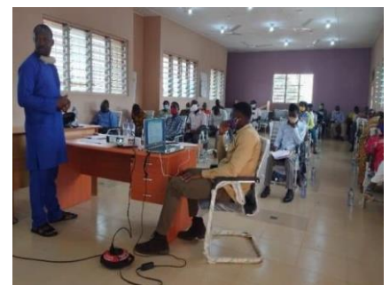
Capacity training session for newly elected Refugee Leadership Council in Fetentaa