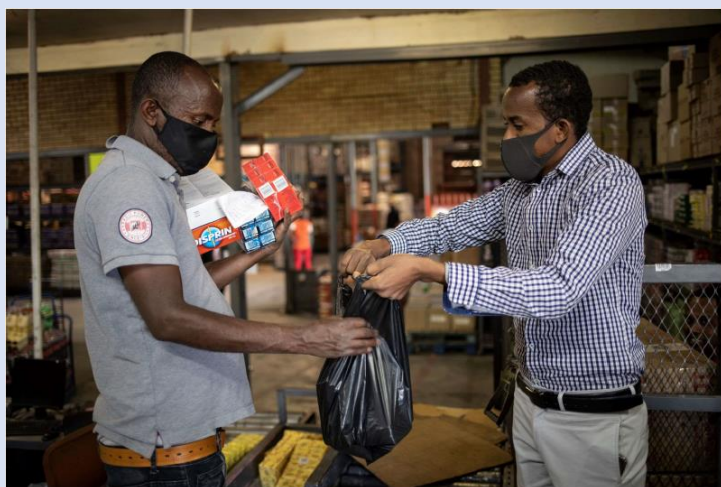
A Somali refugee business-owner hands an assistance package to a South African man during a distribution in Pretoria.