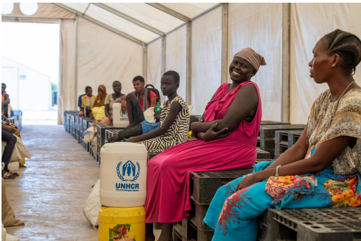
Kenya. Food and relief items distributed during COVID-19 global pandemic