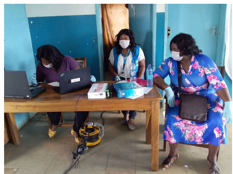
UNHCR and partner staff at a Community Help Desk in Meheba Refugee Settlement