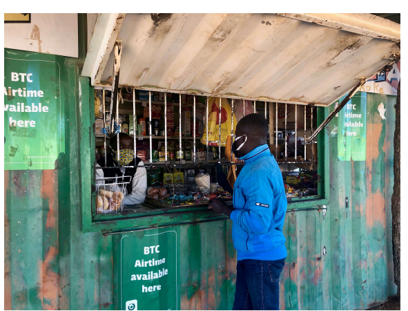
A customer wears a face mask while shopping for groceries in Dukwi refugee camp, Botswana.

■ Since 1 April... 36,800 people in urban refugee and host communities in South Africa received emergency cash assistance to buy food and pay rent; 10,000 host community members received face masks from a refugeerun organization in South Africa's Cape Town; 5,500 refugees in Namibia's and 1.000 settlement refugees Botswana's Dukwi camp benefited from risk communication and upgraded health and sanitation systems, in line with the international guidelines to prevent the spread of COVID-19; 1,000 refugees and asylum-seekers received legal assistance and counselling.