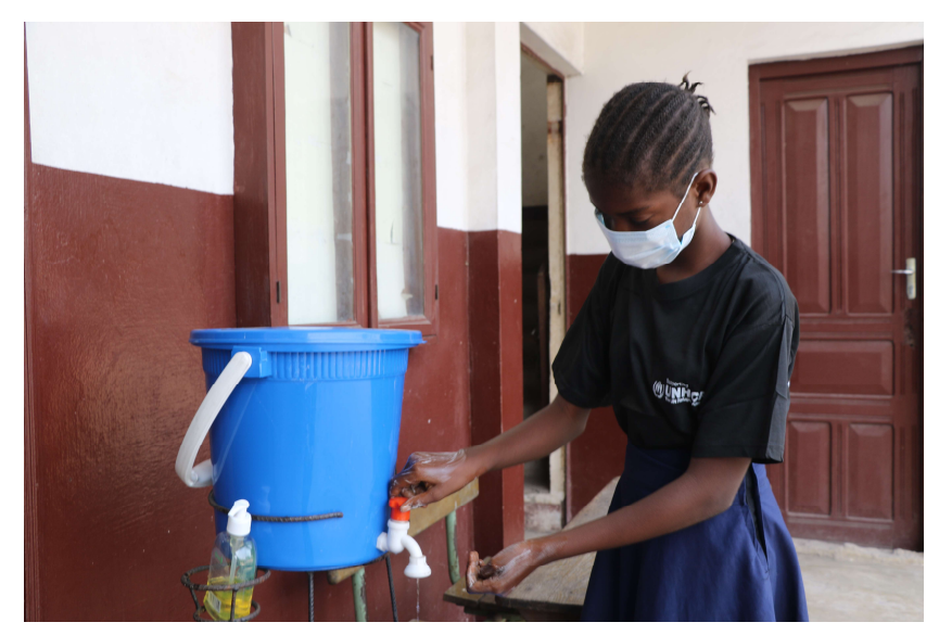
A refugee girl from the DRC washes her hands at a UNHCR-installed handwashing station at a school in Brazzaville