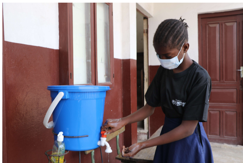
A refugee girl from the DRC washes her hands at a UNHCR-installed handwashing station at a school in Brazzaville