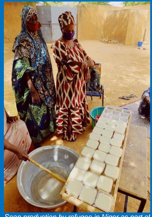
Soap production by refugee in Niger as part of UNHCR's COVID response.

Beyond the positive results in terms of emergency response, this activity is an excellent temporary replacement for many psychosocial activities who have to be put in stand-by due to the forced social distancing required by the COVID-19 situation. The activity also help many vulnerable displaced persons to cope with the situation and to develop hope and resilience in their current situation.