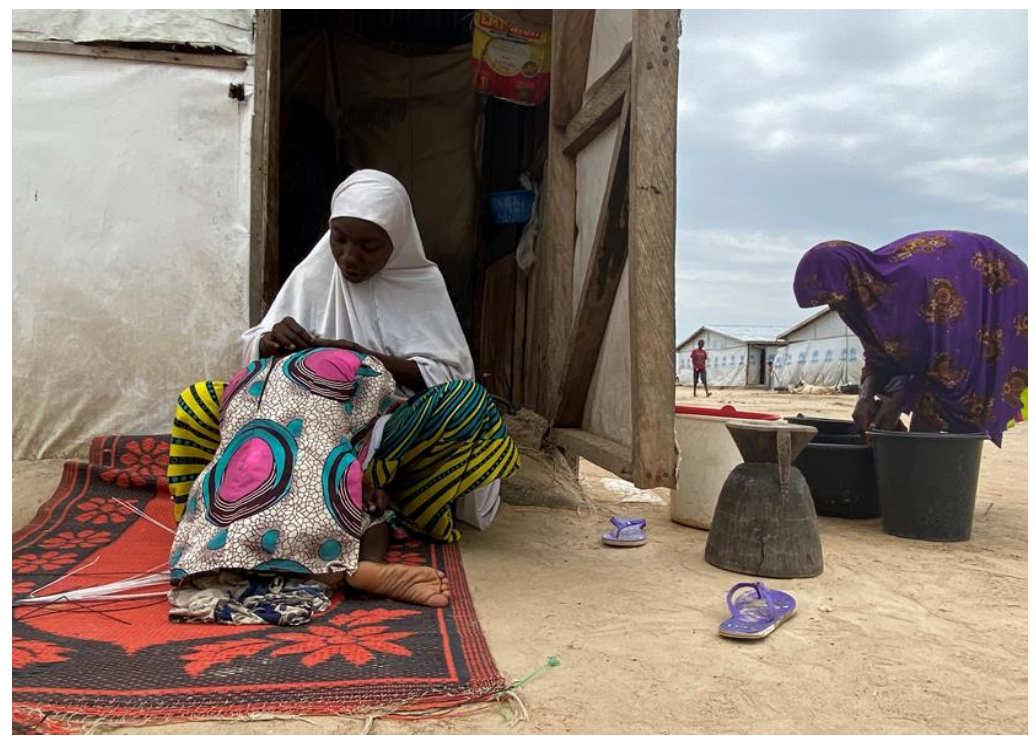
IDP Women in Northeast Nigeria preparing for return home with the assistance of UNHCR.

forcibly displaced population is also increasing the risk of resorting to negative coping mechanisms, including child labour which UNHCR is monitoring closely.