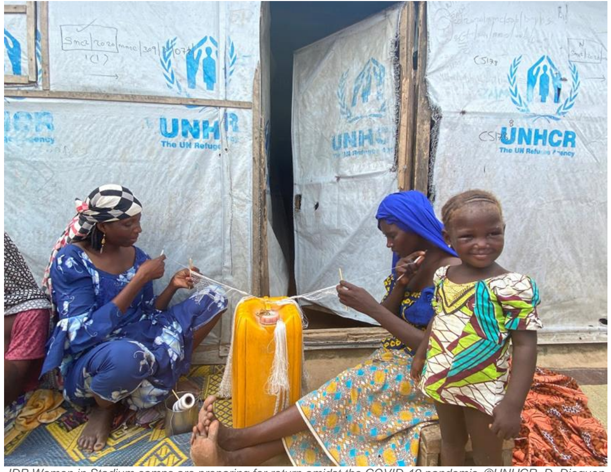
IDP Women in Stadium camps are preparing for return amidst the COVID-19 pandemic.