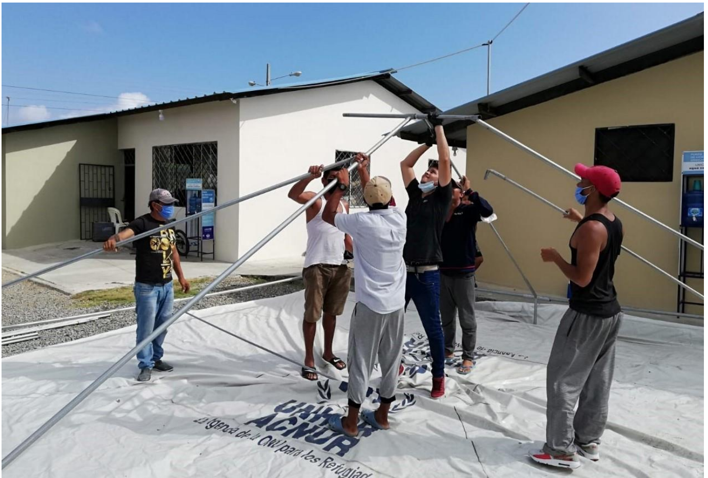
Installation of tents outside of a shelter in Huaquillas, El Oro Province.