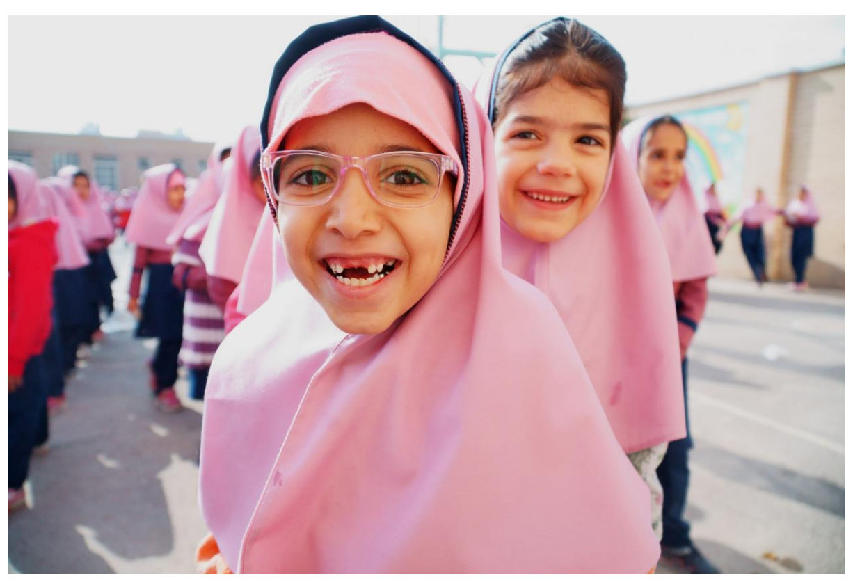
Iran. Afghan refugee sisters in Isfahan go to school for the first time.