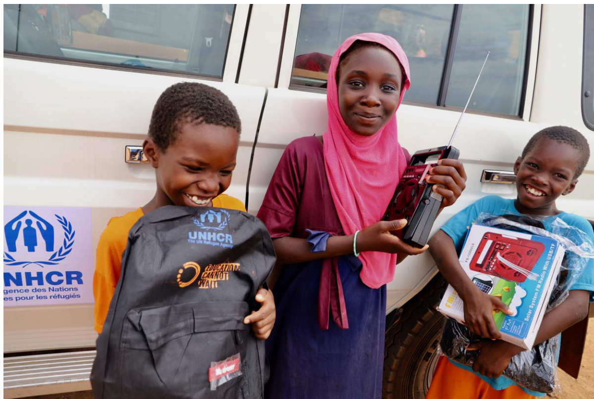
Mali. Internally displaced Malian children receive solar-powered radios and school kits from UNHCR at Sarema school, to facilitate distance learning.