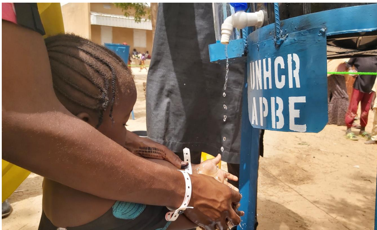
Learning preventive measures against COVID-19 as early as possible. This Nigerian refugee is among over 15,000 recently arrived in the Maradi region in Niger who are being relocated to villages over 20km away from the border.