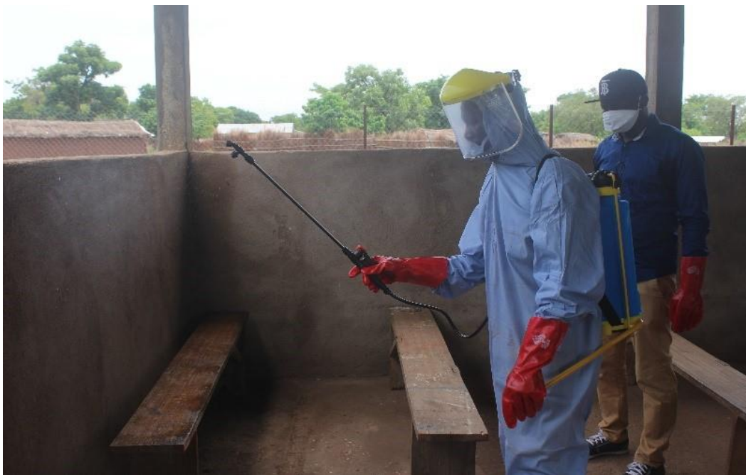
Training of 18 health agents on disinfection and decontamination techniques at Dosseye camp in the Gore region in southern Chad.

including fumigation. UNHCR is also supporting the improvement of ICT infrastructure to facilitate distant learning methods by providing increased connectivity, expanding radio broadcast coverage, establishing Wi-Fi hotspots, and providing laptops to teachers.