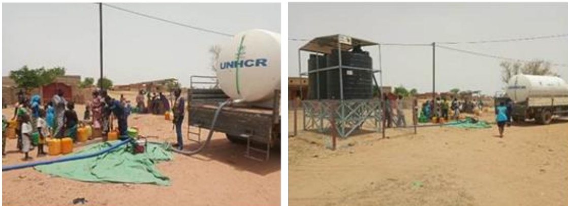
Provision of drinkable water to IDPs, refugees and host communities in Dori through water trucking.