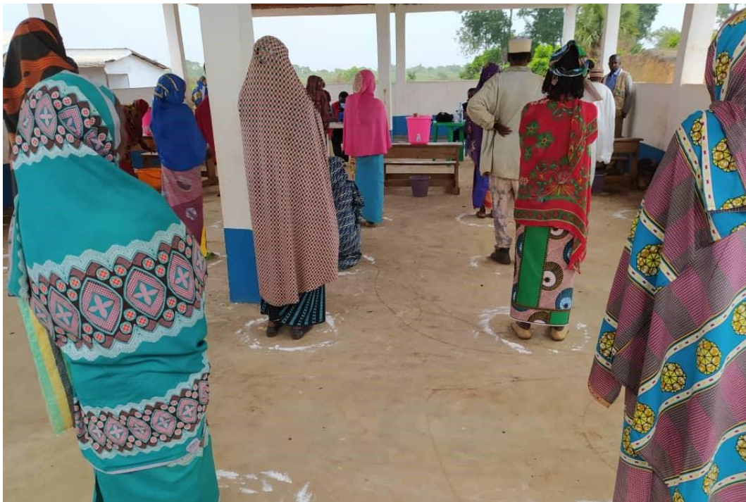
Respecting social distancing and other preventive measures during a distribution of relief items in Gado Badzere refugee camp, Eastern region. Cameroon.

UNHCR Operations are taking steps to ensure continuity of assistance and basic protection services despite movement restrictions through teleworking and remote protection and assistance. UNHCR operations are also stepping up their engagement and advocacy with Governments, the UN country teams and other Inter-Agency platforms to contribute to a coordinated response to the COVID-19 crisis and to ensure that persons of concern are included in all relevant response plans.