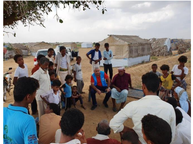
UNHCR staff holds a meeting with the IDP and community leaders in an IDP hosting site in Az Zuhrah district, north of Hudaydah governorate. Tehama shelters- adjusted emergency shelters for the local climate, can be seen at the background.

Number of IDPs under FO Hudaydah who received services, cash, or in-kind support UNHCR June 2020