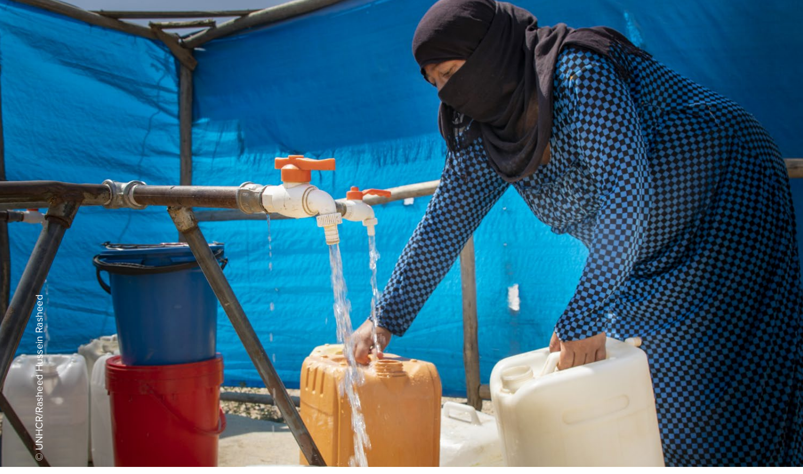
Iraq: clean water reaches IDPs in the Salamiyah 1 camp, Nineveh. Access to water is essential for applying hygiene rules recommended in the fight against COVID-19.