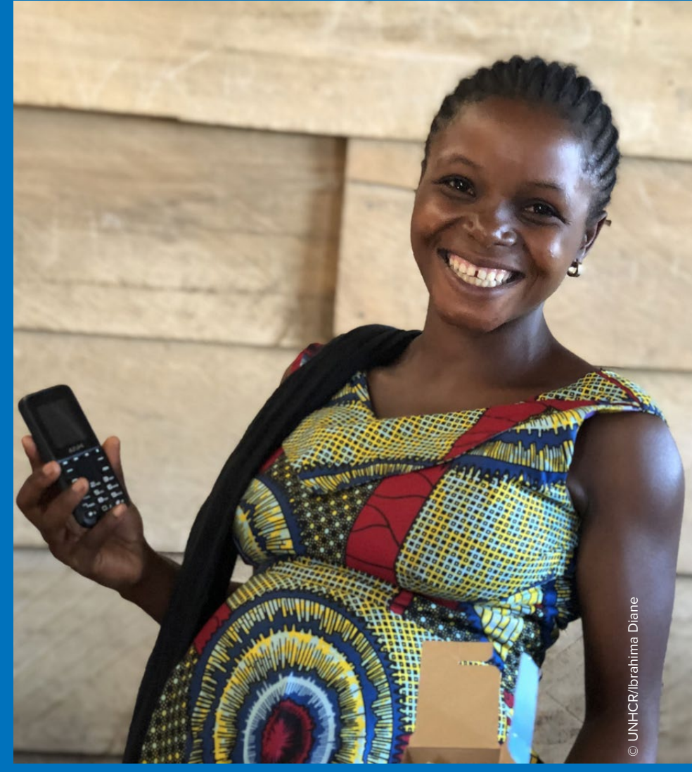
DRC: Mobile money helps IDPs prepare for COVID-19. Internally displaced Congolese woman, receives a mobile phone and SIM card at a distribution site in Beni, North Kivu.

UNHCR is distributing money by mobile phone to 6,000 vulnerable families uprooted by conflict and already facing a deadly Ebola outbreak. Provision of mobile phones and SIM cards to displaced families allows them to receive electronic payments. They can choose to prioritize needs that might range from food, to clothing, health care and shelter.