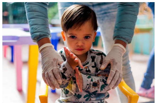
Sensitization session on hands washing with children in La Paz