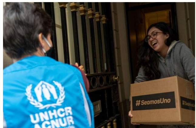
Venezuelan receiving food boxes amidst the COVID-19 pandemic in Buenos Aires

41 National staff 10 International staff