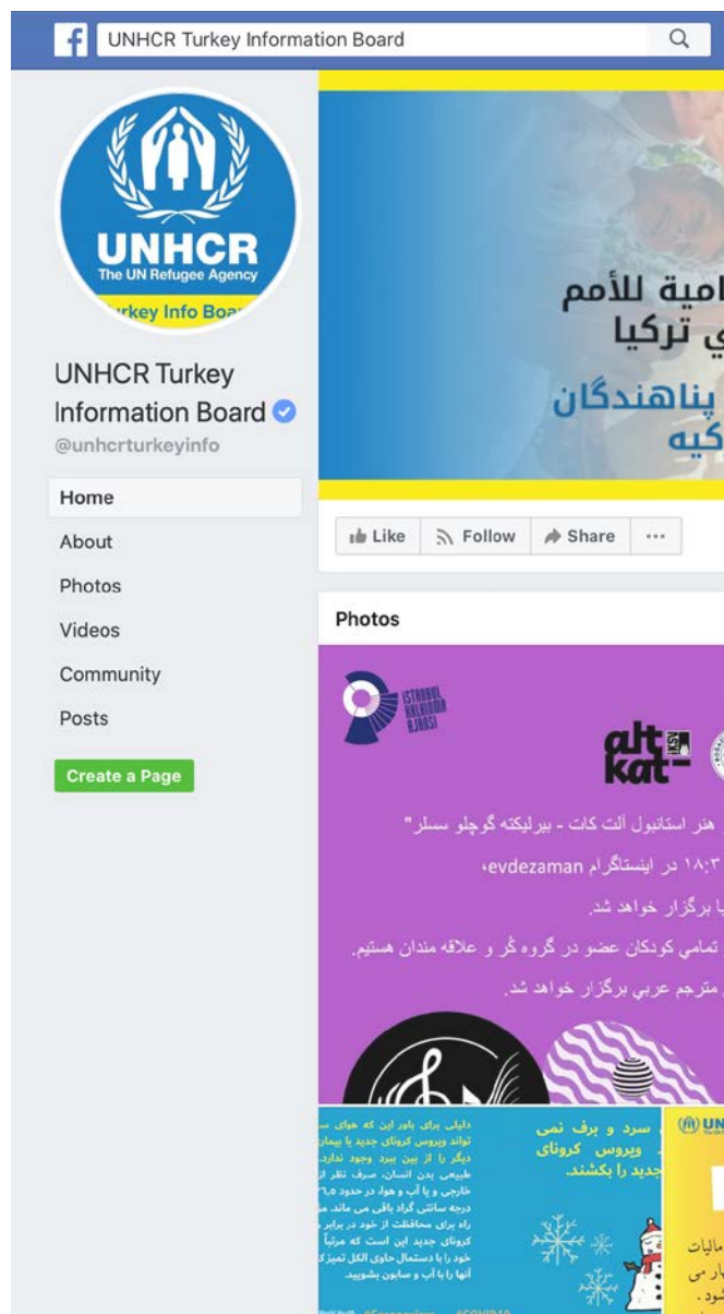
The Turkey Facebook page, received queries and published COVID-19 related awareness posts and videos in Arabic and Farsi were shared on a daily basis.

Social media platforms have been essential to allow two-way interaction with large numbers of participants. Facebook pages are operational in multiple languages in all countries . The Turkey Facebook page, with 57,681 followers , received queries and published COVID-19 related awareness posts and videos in Arabic and Farsi were shared on a daily basis. In Tunisia , the Facebook page “We Hear You” – run by partner CTR - allows for discussion real time and on COVID-19 related matters. In Morocco , video messages were published in several platforms, while key information is being shared on a daily basis in three languages.