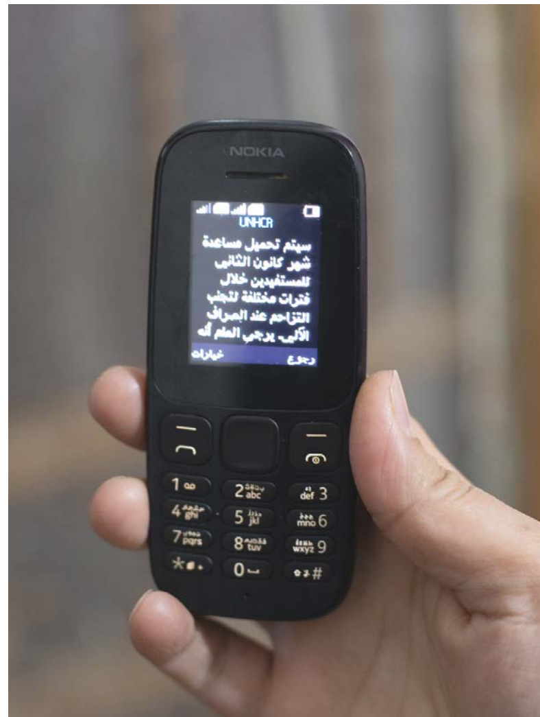
In Lebanon and Jordan, over 9 million SMS and WhatsApp messages were sent in 2019 on distributions, cash assistance and other crucial information either to entire refugee population or targeting specific profiles.

Facebook and other social media platforms are increasingly becoming central to how forcibly displaced people access and share information. Across the region, UNHCR works through social media platforms, and supports community groups to manage Facebook and WhatsApp groups.