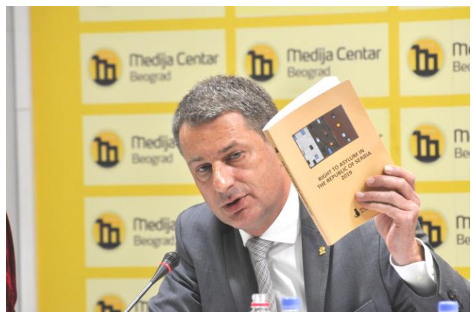
Presentation of "Right to Asylum in the Republic of Serbia" Annual Report for 2019, ©BCHR, 27 February 2020

CO in Belgrade and FU in South Serbia for regular protection monitoring in five Asylum Centres and 25 other sites across the country