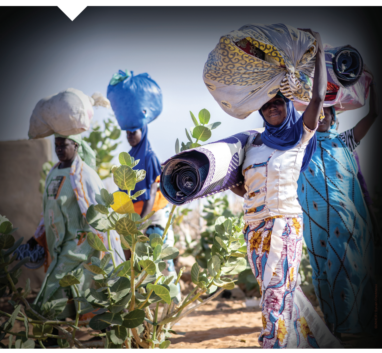
Crisis in the Sahel: UNHCR emergency and protection response