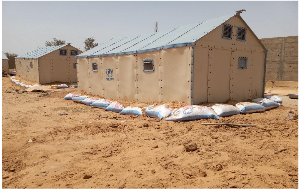
In Burkina Faso, RHUs were built to provide sturdier homes to IDP families affected by the heavy rainfalls and the floods in Wendou in the Sahel Region.