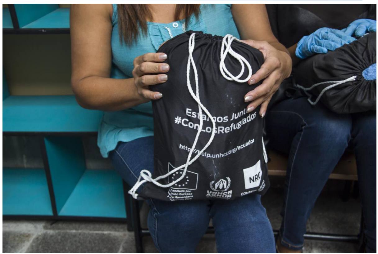
Ecuador. To incorporate COVID-19 prevention support into existing services for refugees and asylum seekers, UNHCR provides hygiene kits to women survivors of sexual and gender-based violence.