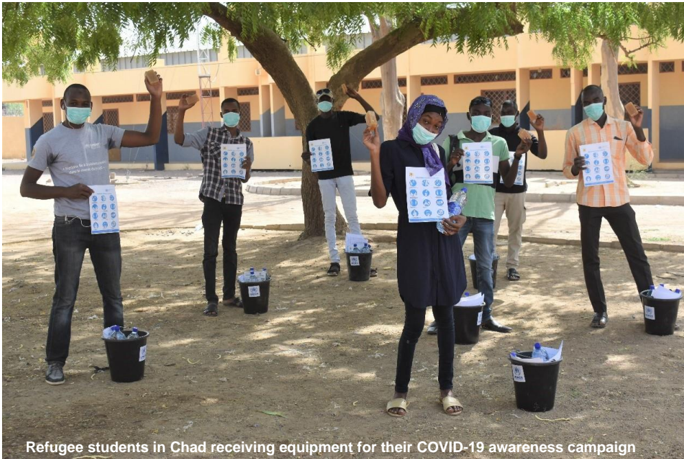
Refugee students in Chad receiving equipment for their COVID-19 awareness campaign