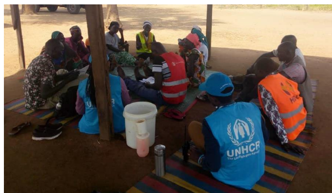
UNHCR, HDC and Save the Children International facilitate a focus discussion group as part of the initial rapid needs assessment in Doro refugee camp