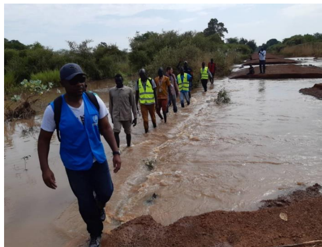
UNHCR and partners continue towards Gendrassa refugee camp on foot due to portions of the road having been washed away.