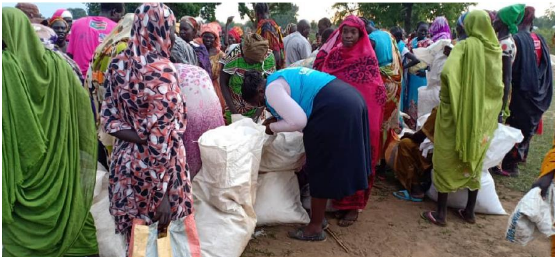
UNHCR, WFP and partner Humanitarian Development Consortium assist in the emergency food distribution to the host community in Doro.