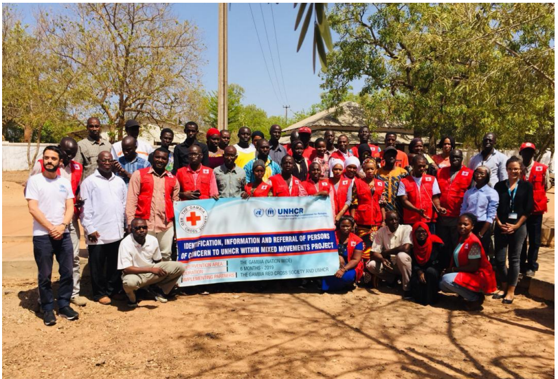
UNHCR and the Gambian Red Cross Society (GRCS) training on the identification of persons of concern in mixed movement situations.

In June. UNHCR's Regional Representative for West Africa, at the invitation of authorities, participated in the inauguration of the opening of the "Good Neighbor Cultural Box" in Demet. near the border Mauritania. UNHCR prospected the "Good Neighbor Cultural Boxes" in Diawara and Sylla in the Senegal River Valley at the invitation of the Senegalese National Commission of