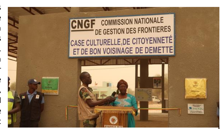
UNHCR's Regional Representative for West Africa, Liz Ahua, at the opening of the « case culturelle » in Demet, Senegal.

Documenting the scale and nature of risks and abuses along travel routes is challenging. For many, the crossing of the Mediterranean is just a final step of a much longer and often very dangerous journey that has included passing through areas of armed conflict, crossing deserts, and for some, being held for ransom and tortured, or trafficked for sexual or labour exploitation. Evidence suggests that refugees on the move across West and North Africa are at risk of death, extreme physical abuse, sexual and gender-based violence, kidnapping, robberies and detention. Refugee protection in the context of mixed movements is part UNHCR's core mandate and should mainstreamed into the regular activities of the operation.